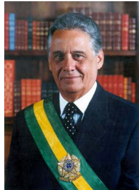
Fernando Enrique Cardoso