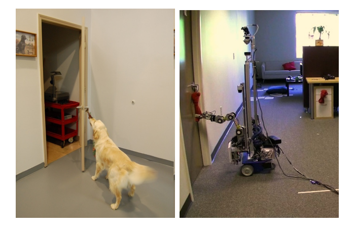
Fig. 1. On the left, a service dog opens a door using a bandanna tied to the door handle. On the right, our assistive robot opens a door in an analogous manner.

Autonomous mobile robots with manipulation capabilities offer the potential to improve the quality of life for people with motor impairments. With over 250,000 people with spinal cord injuries and 3,000,000 stroke survivors in the US alone, the impact of affordable, robust assistive manipulation could be profound [4], [5]. Moreover, as is often noted,