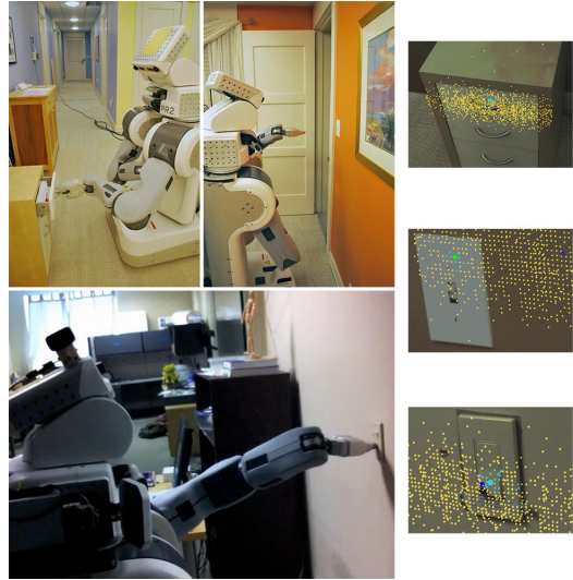
Fig. 1. Left: Willow Garage PR2 operating a drawer, light switch and rocker switch using learned task-relevant detectors. Right: Results from learned detectors during execution.

Given these three assumptions, our active learning method enables a mobile manipulator to autonomously learn which 3D locations are likely to result in successful execution of a behavior. More specifically, the robot learns to classify visual features associated with 3D locations as being associated with