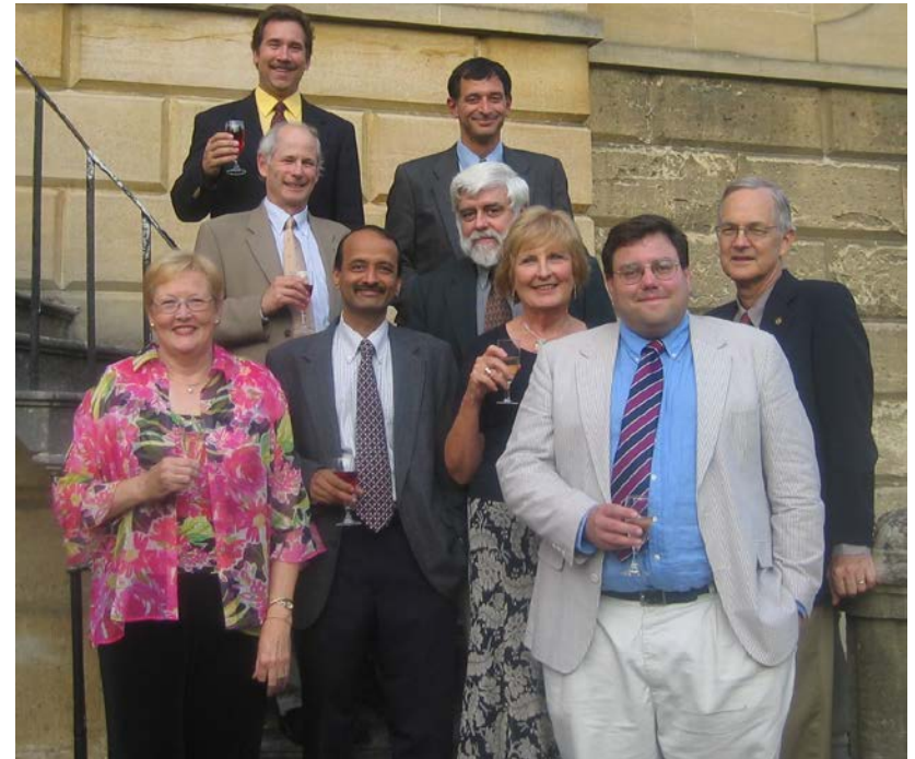
Program Faculty (2006)