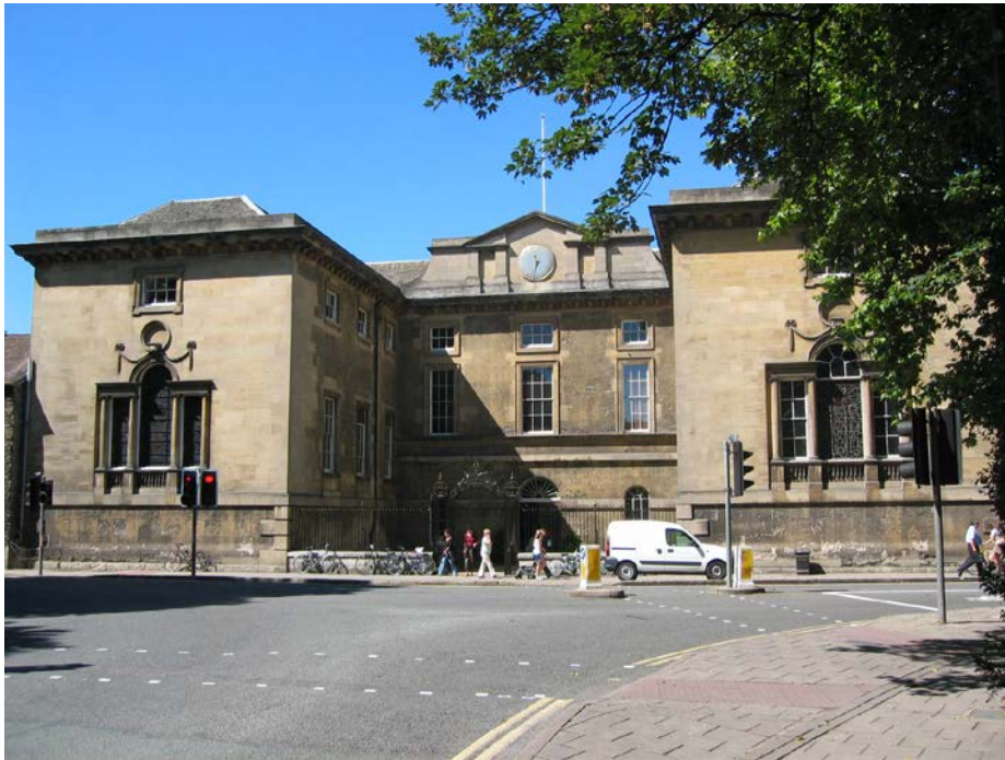
Worcester College entrance