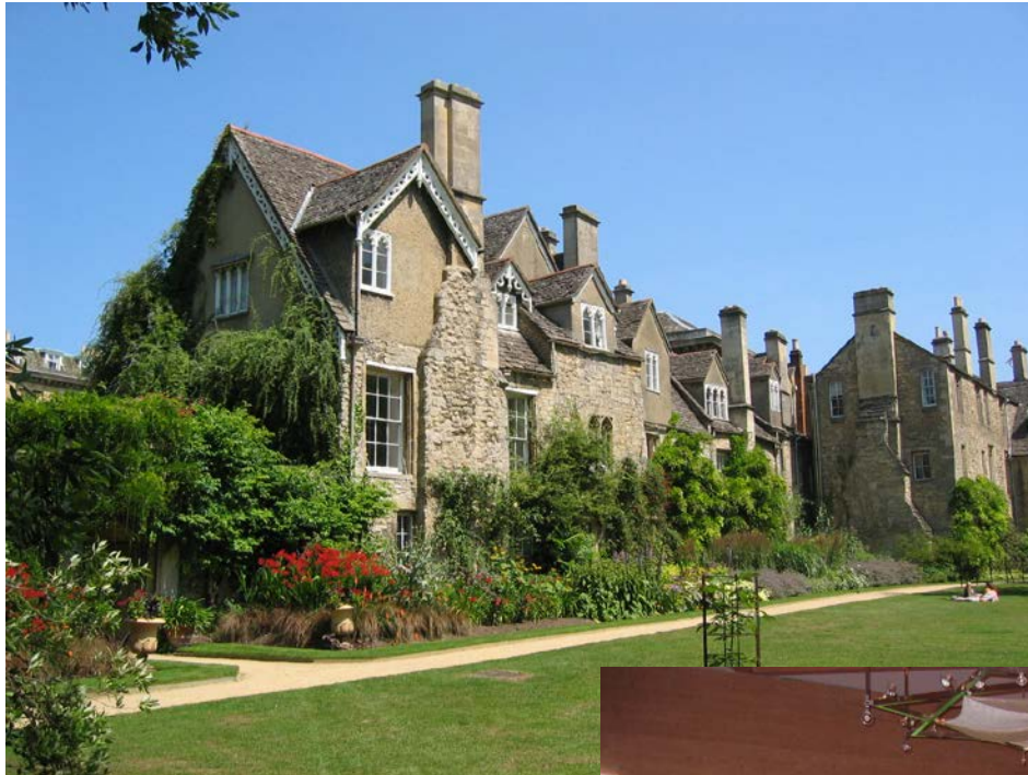
Student rooms in upper floors